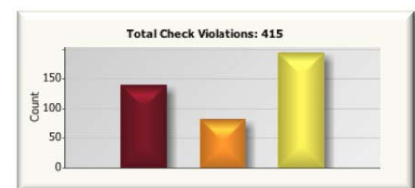
Figure 1 STIG check status

At the United States Marine Corps, the cyber compliance team used to travel to each location to prep for a CCRI audit. They would start with a few sample configuration files. Checking for deficiencies in this small sample would take 3-5 days. At this point, the team would be able to propagate the list of configuration issues out to the network ops team to be remediated. This manual process of complying with DISA regulations was clearly too long—and inefficient.