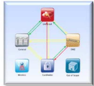
Figure 3 Example of PPSM compliance

Now, after deploying RedSeal agency wide and setting up 14 instances, the agency conducts continuous assessments year round across all data centers. After five years, their feedback has been hugely positive, "We realize now that we can't leverage the other cybersecurity tools unless we have RedSeal. RedSeal is core to our cybersecurity plan."